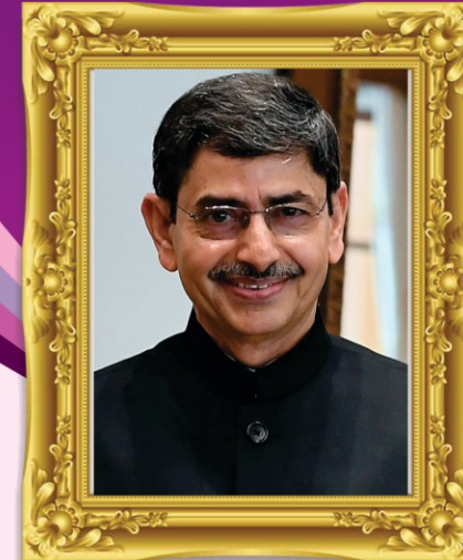
Thiru. R. N. RAVI Hon'ble Governor of Tamil Nadu & President of IRCS TNB