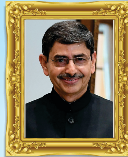
Thiru. R. N. RAVI Hon'ble Governor of Tamil Nadu & President of IRCS TNB