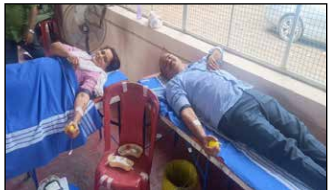
Blood Donation Camp held on 23.11.2025 at St.Thomas School, Avadi, Chennai.