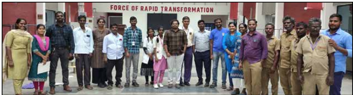
Blood Donation Camp held on 28.11.2025 at ARAN, Sipcot Innovation Centre, Sriperambadur.