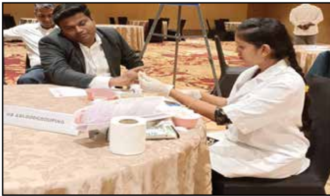
Blood Donation Camp held on 08.11.2025 at Radha Regient Hotel, Ramapuram, Chennai.