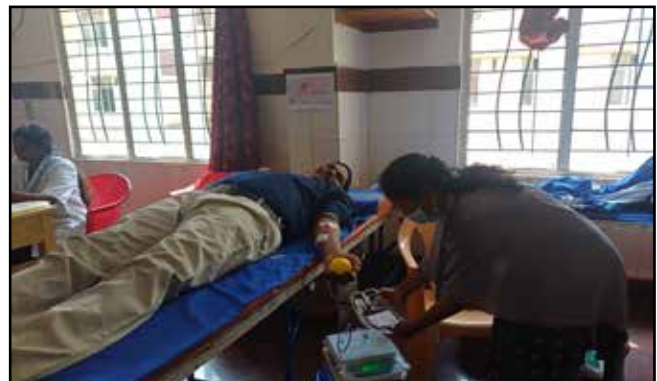
Blood Donation Camp held on 15.11.2025 at Maharishi Vidya Mandir School, Irrungattukottai.