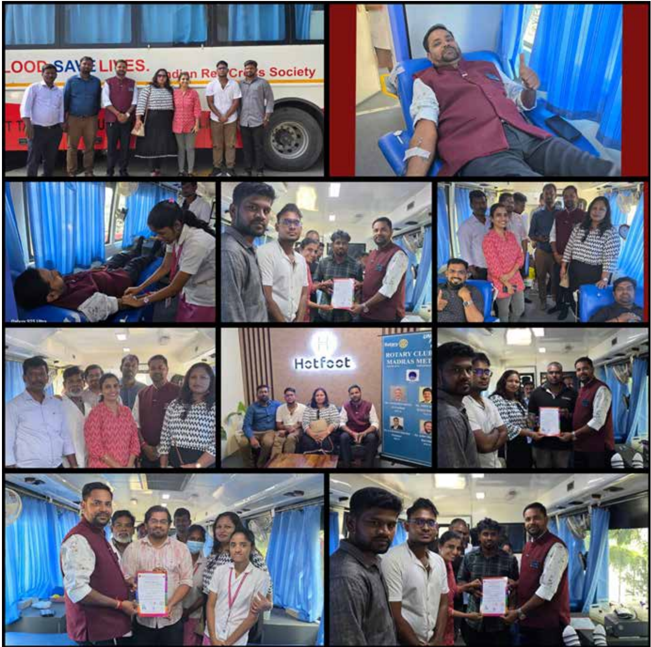
Blood Donation Camp held on 25.11.2025 at Hot Foot Solution Pvt.Ltd., OMR, Chennai.