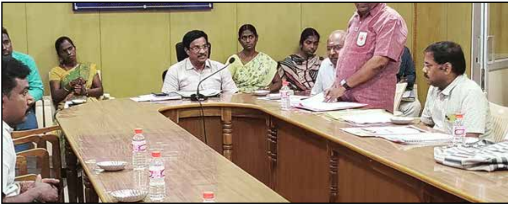
NDRF CHEMICAL EMERGENCY MOCK EXCECISE.. TABLE TOP EXERCISE CONDUCTED ON 9.12.2025 BY IRCS, CUDDALORE DISTRICT BRANCH.